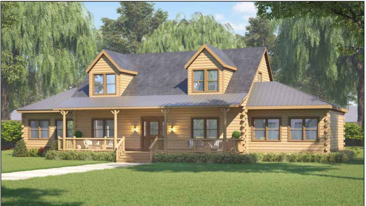
Artist Rendering - Actual Plans May Vary