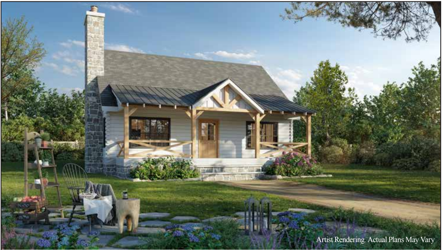
Artist Rendering. Actual Plans May Vary