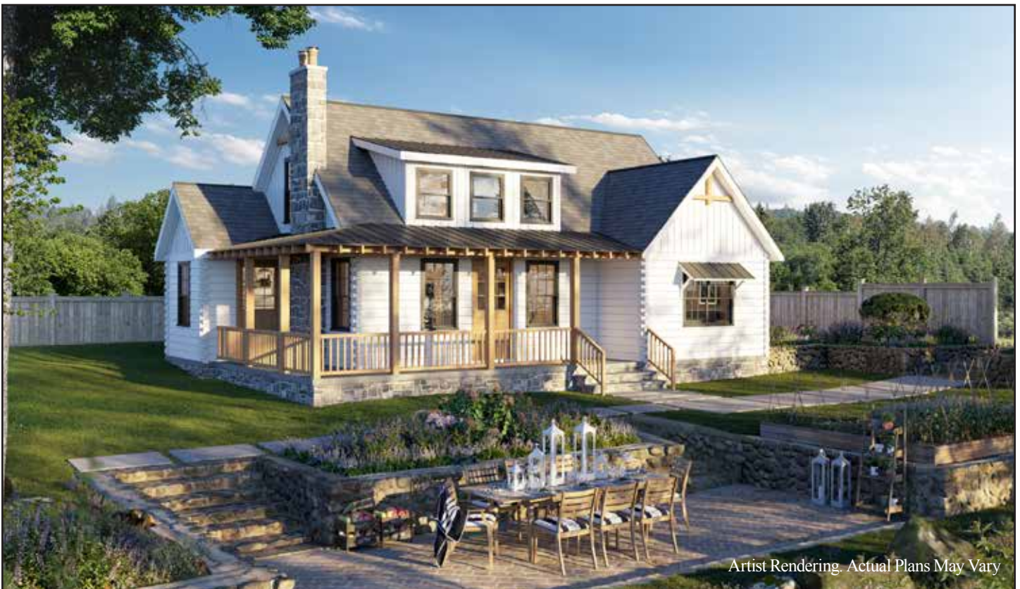
Artist Rendering. Actual Plans May Vary